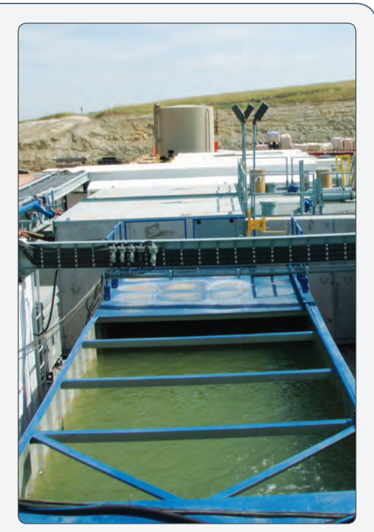
Fluid awaits injection at a fracking site.

Under UIC regulations, new Class II wells are subject to regulations that would require addressing the issue of frack hits, were it not for this loophole.<sup>145</sup> The loophole thus explains how the issue of frack hits has remained beyond regulation, and highlights how the oil and gas industry, through its capture of U.S. energy policy, has erected barriers to protecting public health and the environment.