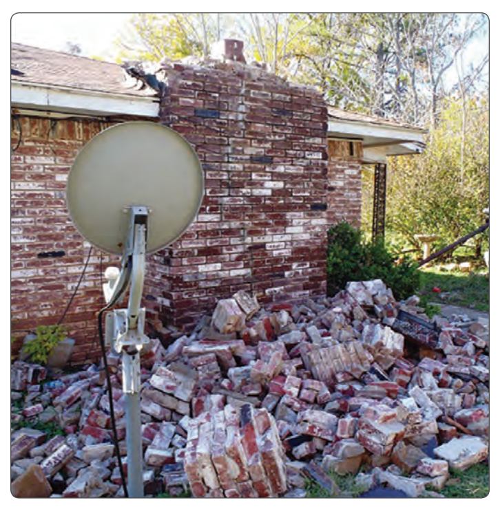
Residential damage from the magnitude 5.7 earthquake in 2011 that struck Prague, Oklahoma.

Scientists now believe that, by pumping large amounts of fluids underground, the oil and gas industry is largely to blame for the significantly increased frequency of earthquakes observed in the United States in recent years.<sup>174</sup> For decades, the central and eastern United States consistently registered about 20 magnitude 3.0 or greater earthquakes per year.<sup>175</sup> In the mid-2000s, this trend broke, and earthquake frequency increased, directly coinciding with the expansion of modern drilling and fracking.<sup>176</sup> In 2010, 2011 and 2012 combined, there were about 300 earthquakes of magnitude 3.0 or greater.<sup>177</sup> In just the first half of 2014, Oklahoma alone registered about 200 magnitude 3.0 or greater earthquakes.<sup>178</sup>