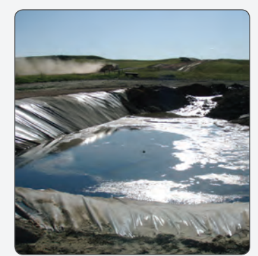
"Mud pit" on a Bakken shale drilling site.

Finally, oil and gas companies bring to the surface various amounts of the chemicals used in fracking, and byproducts from reactions involving these chemicals.<sup>34</sup> Given trade-secret protections in federal and state laws, and otherwise inadequate disclosure requirements, the actual chemical composition of any given fracking fluid injection is unknown, often even to the company doing the injecting.<sup>35</sup> What is known is that fracking fluids often have toxic compounds, including methanol, isopropyl alcohol, 2-butoxyethanol, glutaraldehyde, ethyl glycol and BTEX.<sup>36</sup> Hydrofluoric and