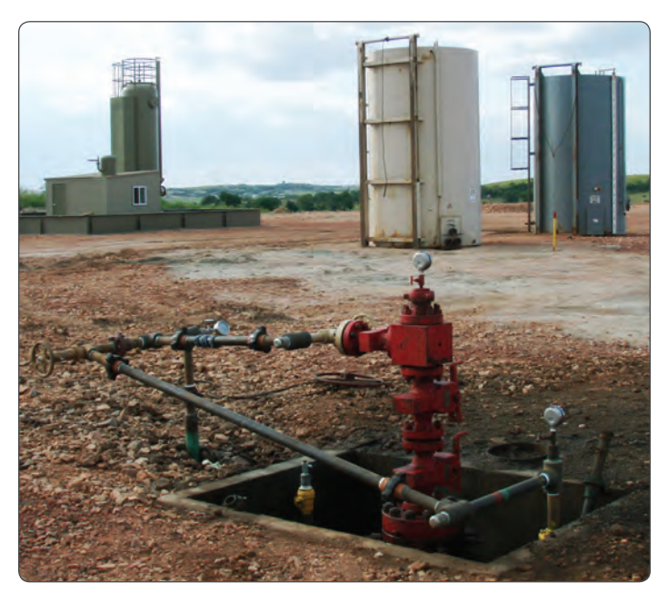
A well head after fracking equipment has been removed from the drilling site.

Fluids may also leak from oil and gas wells through small fractures or channels that form within the interior of the constructed well, either within the cement itself or between concentric cylinders of cement and metal pipe, or casing, used to build the well.<sup>128</sup> Improper centering of casings gives rise to less uniform flows of cement during the construction of the well, and this in turn is another factor that increases the risk of well integrity failures.<sup>129</sup> Gradual settling over time due to the extraction of oil and gas also applies stress that may eventually break, or crack, constructed wells, leading to failure.<sup>130</sup>