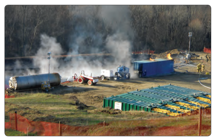
Battling a fracking wastewater liner fire in Hopewell Township, Pennsylvania.

The open scientific questions surrounding the impacts of fracking amount to irreducible and unacceptable risks.