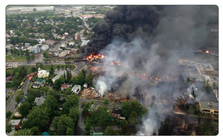
Aftermath of the Lac-Mégantic, Quebec, oil train derailment in July 2013.

Oil and gas industry earthquakes have taken many by surprise, but scientists have long known that injections (and withdrawals) of fluids beneath the surface can induce earthquakes.<sup>187</sup> Few, if anyone, however, anticipated the